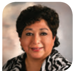
Mayuli Bales Casa Guadalupe & Catholic Charities